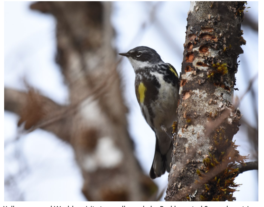
Yellow-rumped Warbler visits tap wells made by Red-breasted Sapsucker at Juneau Community Garden on May 6, 2023, World Migratory Bird Day.

Lecture Following Elections: "Plight of the penguins. A changing population demographic for the penguins of the Antarctic peninsula "by Tyler Stern