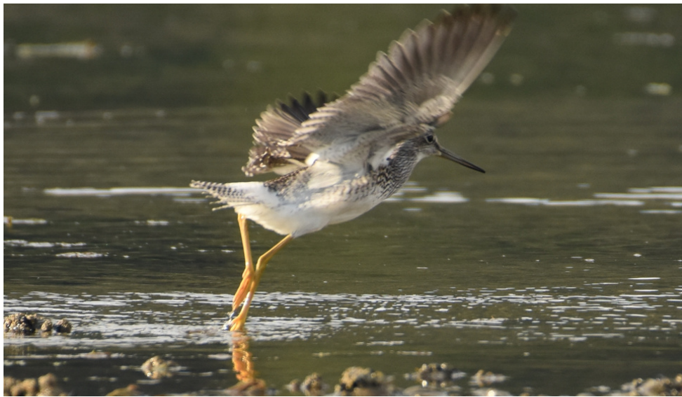
Greater Yellowlegs.

administration canceled the application of the nationwide Roadless Rule to the 9 million acres of the Tongass that were previously protected. The public submitted nearly half a million comments — more than 60,000 comments coming from Audubon members — during the federally required public process. The U.S. Forest Service analyzed a subset of the comments, finding 96% support keeping the Roadless Rule in force, and only 1% support the exemption ultimately selected by the Trump administration.