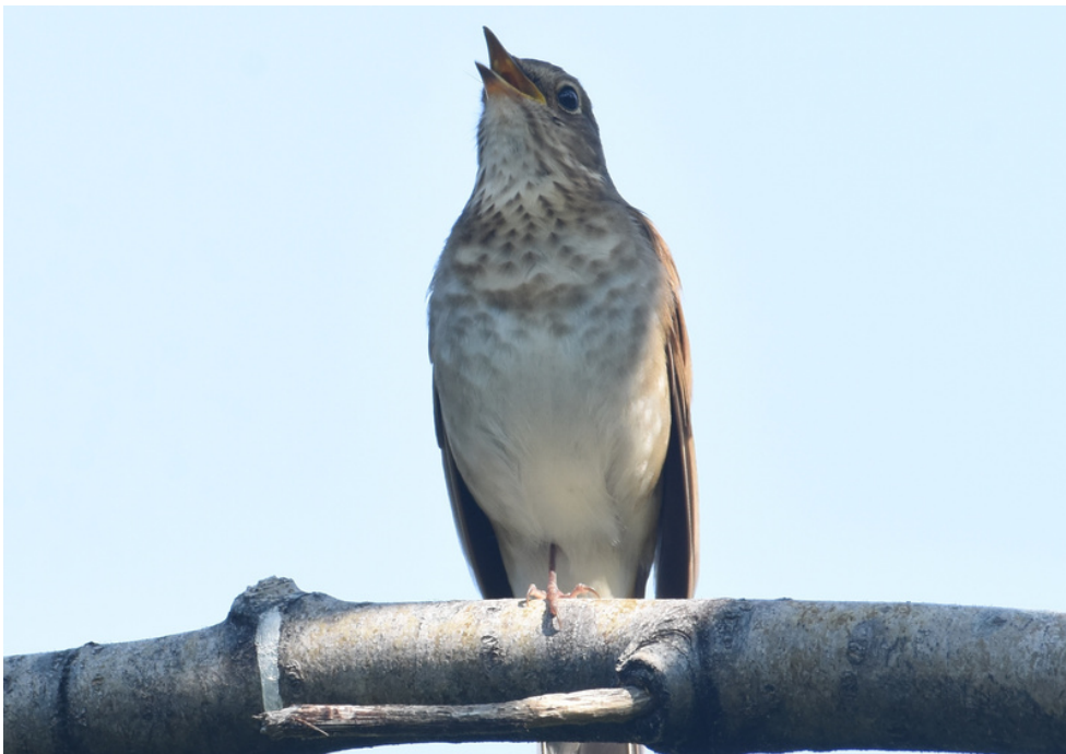
Swainson's Thrush.

WCS was implemented as an “experiment” that included several critical underlying assumptions. The effectiveness of achieving desired and expected outcomes relies on the implementation of a comprehensive, long-term monitoring plan or scientific studies to examine the robustness of the underlying assumptions. Amendments to TLMP have occurred since 1997 (2008, 2016), yet today the Tongass WCS remains largely intact. Unfortunately, a continuous decline in funding since 1997 has limited resources and capability to implement a proposed comprehensive long-term monitoring plan for sensitive species. Consequently, there has been limited documentation regarding the implementation of management or conservation actions or corresponding responses and outcomes for intended forest resources. Fortunately, there have been a number of scientific studies that examined vital underlying assumptions of essential WCS procedures and elements. The results and implications of those studies will be published in a journal article available later this year.