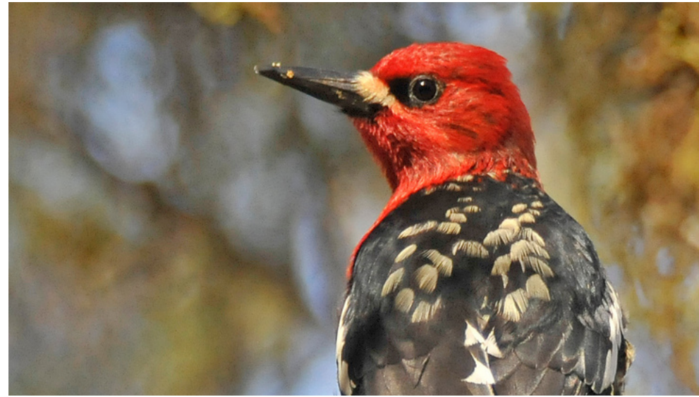
Red-breasted Sapsucker.

The Tongass' 17 million acres are the ancestral homeland of the Tlingit, Haida, and Tsimshian peoples and serve as the country's largest forest carbon sink — holding approximately 44% of all carbon stored in the United States National Forest system according to Audubon's Natural Climate Solutions Report. Hundreds of species of