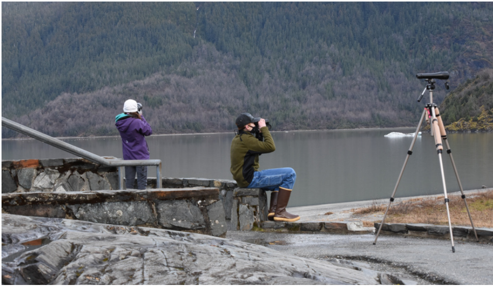
Citizen science volunteers.