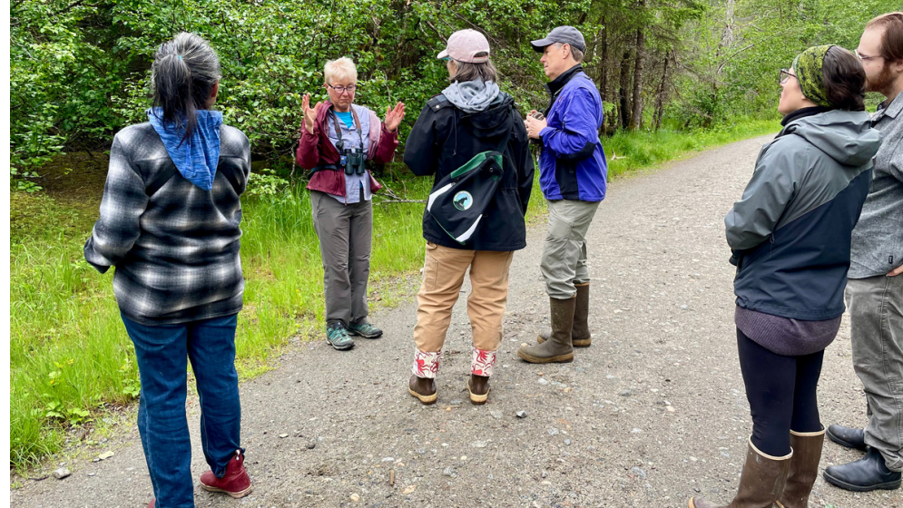
JAS field trips are back!

Please note: The Raven, a publication of the Juneau Audubon Society, is moving to a quarterly publication schedule. Please expect The Raven to be mailed out and published online in January, April, July, and October 2023.