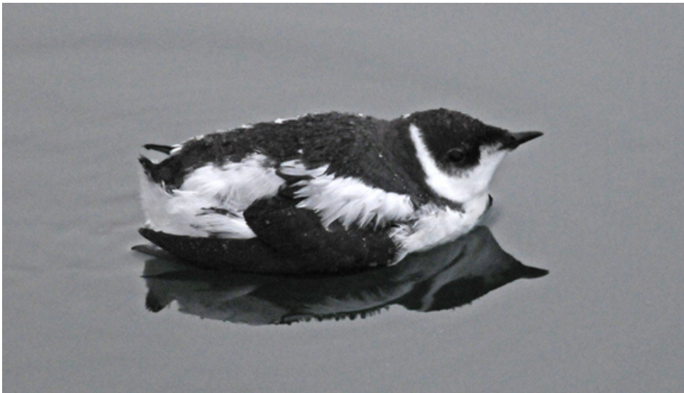
Marbled Murrelet in the Tongass National Forest.