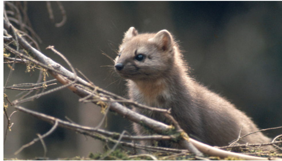
American Marten.

An eighth panel evaluated old-growth ecosystems, assigning likelihood scores to outcomes that characterized the expected persistence of interconnected and representative ecosystems across southeast Alaska, which considered (1) if old-growth forests would be equal to or greater than the long-term (100 years) average and is well distributed across environmental gradients, provinces, community types; and (2) whether connectivity (unimpeded