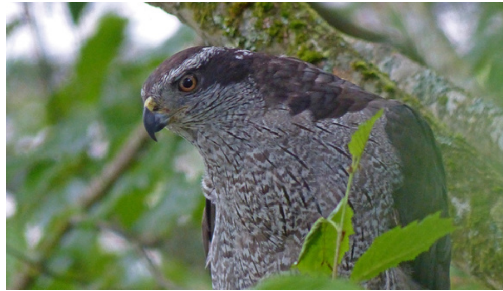
Northern Goshawk.

For example, the northern goshawk was designated a sensitive species and underwent viability risk assessment. Goshawks received special consideration on the Tongass largely because of concerns over populations of the endemic Queen Charlotte Goshawk. Formally described as a metapopulation (multiple separated subpopulations), the Queen Charlotte Goshawk's distribution includes Prince of Wales and barrier islands, coastal British Columbia, and nearby islands. The Tongass forest-wide policy is focused on protecting confirmed and probable goshawk nests, which standards and guidelines propose to accomplish through maintaining an area greater than or equal to 100 acres of productive old-growth forest and generally centered over the nest