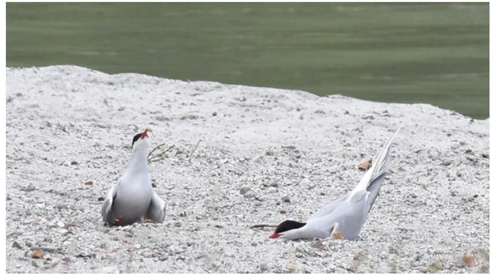
Arctic Terns in courtship.