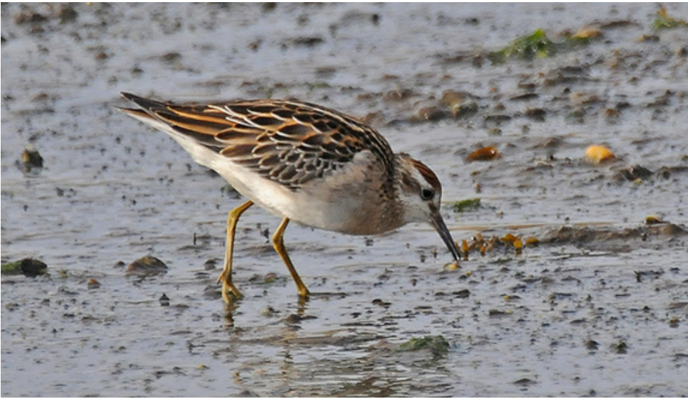
Sharp-tailed Sandpiper on the Mendenhall Wetlands.